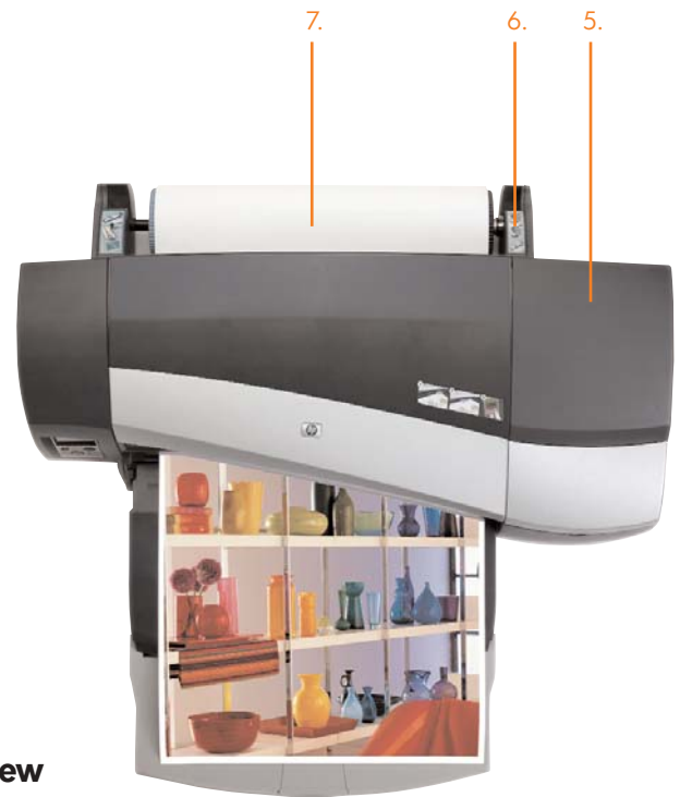
HP Designjet 90r Printer top view