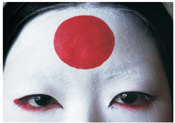
'Japanese Face'

Dye-based HP Vivera inks provide rich color depth, minimal dot visibility, and uniform gloss-all important attributes of image quality.